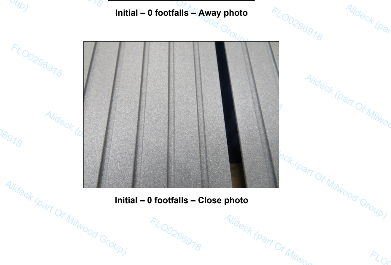
Initial - 0 footfalls - Close photo Alideck (part Of Milwood Group)

Rep. Rep. Of Milwood Group) SATRA Report Reference: FLO0296918 2015 Report ID/Issue number: 12145/1