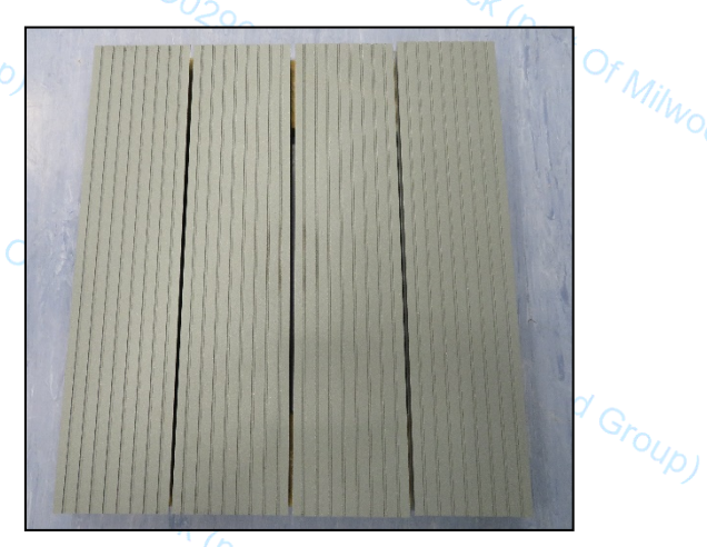
After 50,000 footfalls - Away photo