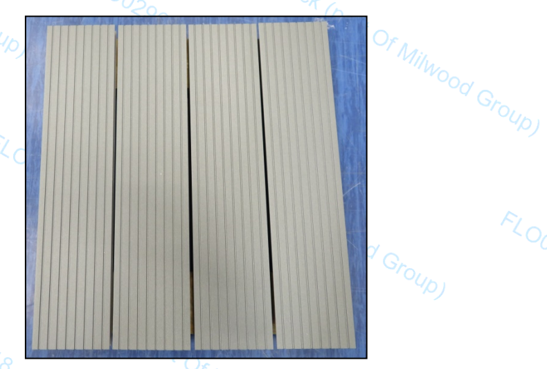
Initial - 0 footfalls - Away photo