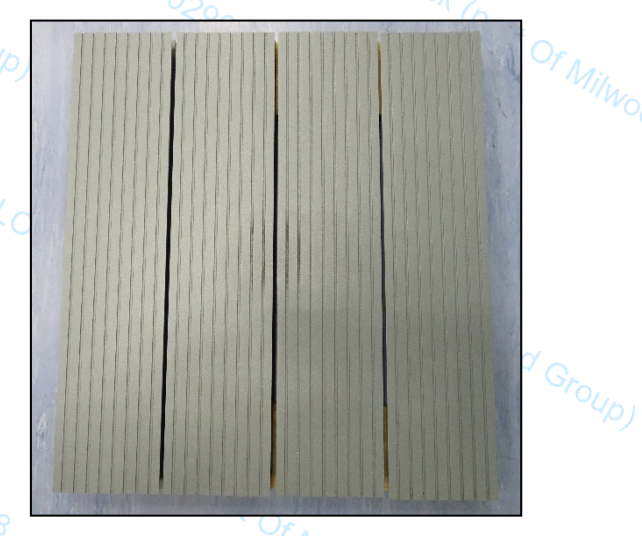
After 100,000 footfalls - Away photo