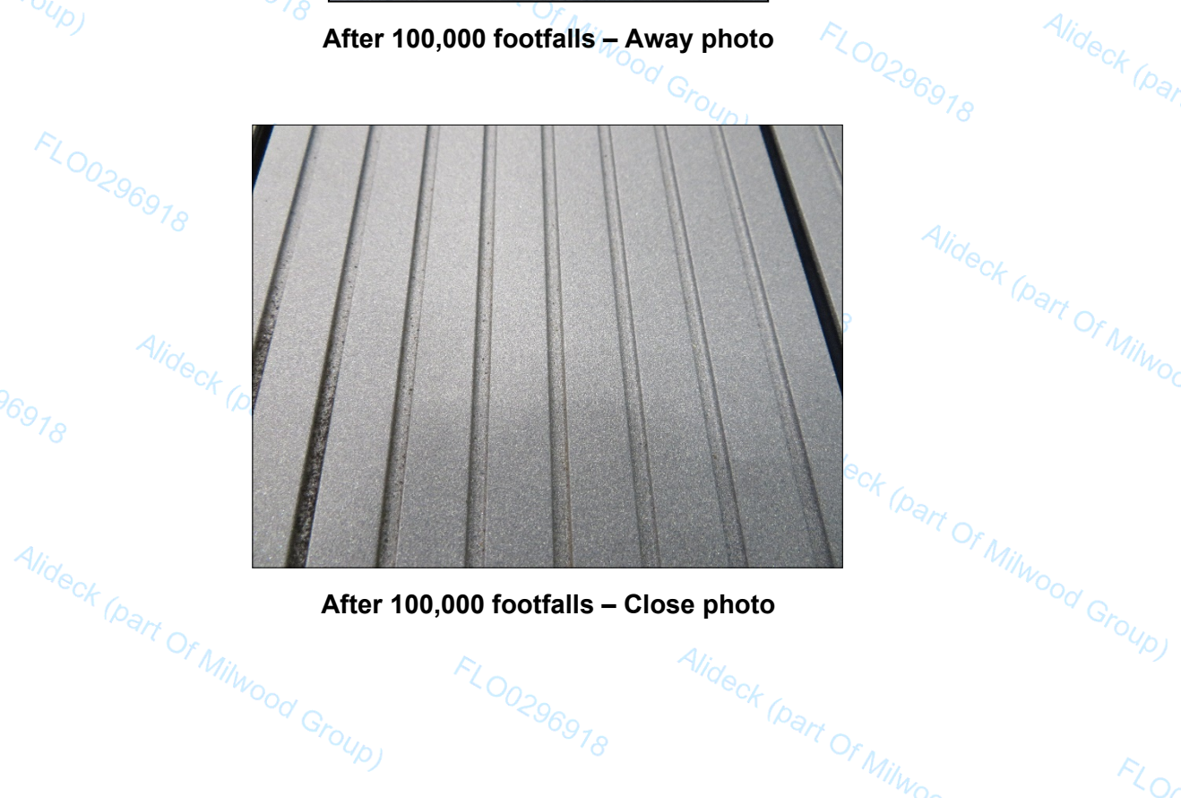
After 100,000 footfalls - Close photo Alideck (part Of Milwood Group)

Rep Rep Of Milwood Group) SATRA Report Reference: FLO0296918 2015 12145/1 Report ID/Issue number: