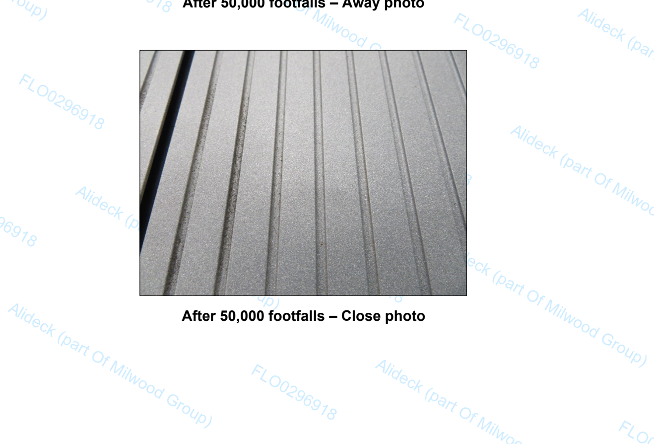
After 50,000 footfalls - Close photo

Rep. Rep. Of Milwood Group) SATRA Report Reference: FLO0296918 2015